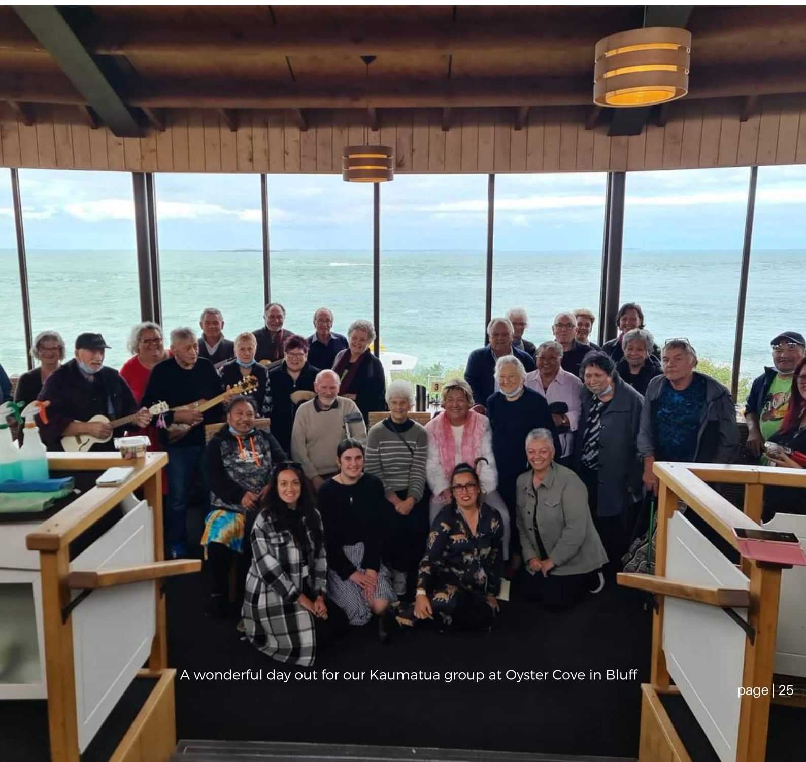
A wonderful day out for our Kaumatua group at Oyster Cove in Bluff