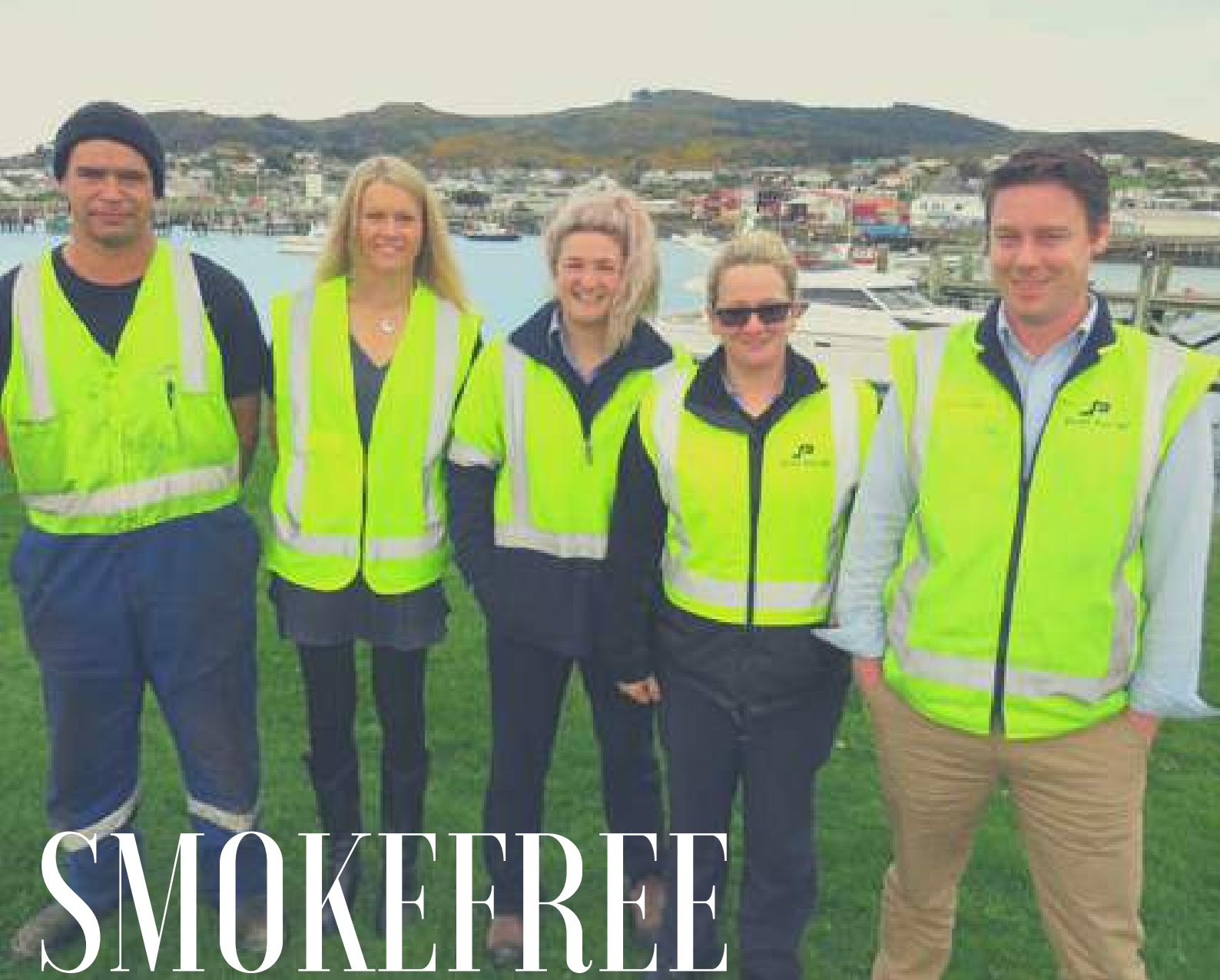
South Port Staff, Bluff.